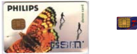
Figure 2: The two current UICC formats

The only difference between these two cards is the plastic cutting.