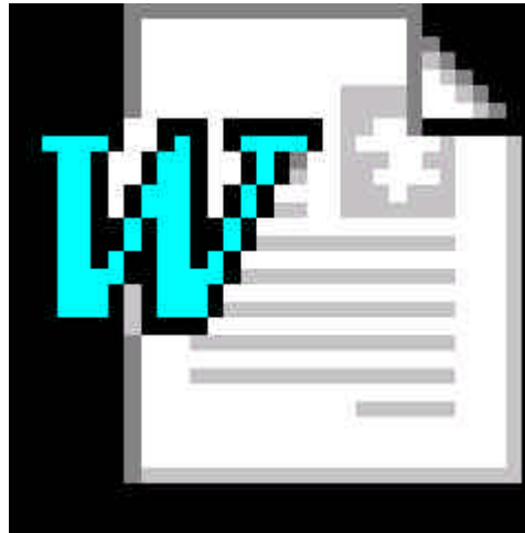
Table 4 Matrix 1.doc