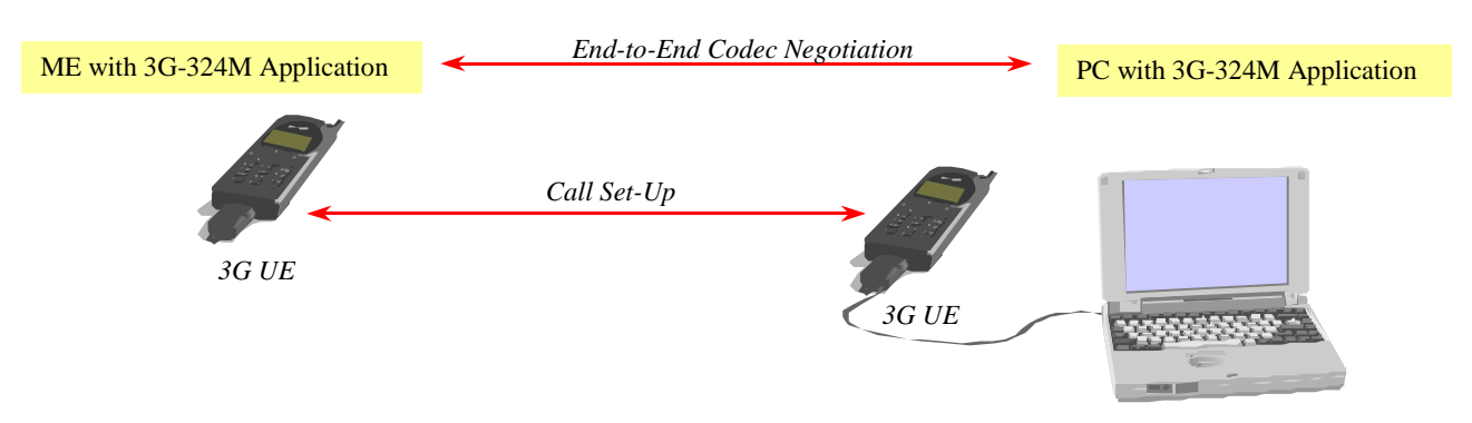
Figure 2 : 3G-324M Call Configuration involving one PC supporting a 3G-324M application connected to a 3G UE serving as modem and a 3G UE also supporting a 3G-324M application