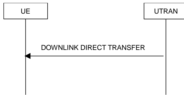
Figure 8.1.9-1: Downlink Direct transfer, normal flow