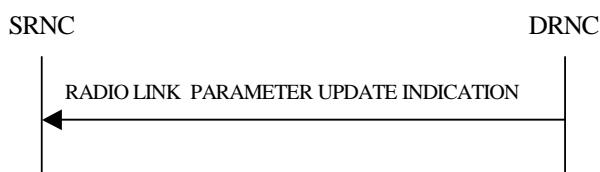
Figure 26E: Radio Link Parameter Update Indication, Successful Operation

The Radio Link Parameter Update procedure is initiated by the DRNS by sending the RADIO LINK PARAMETER UPDATE INDICATION message to the SRNC.