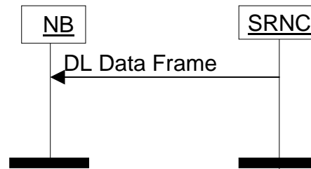
Figure 2: Downlink data transfer

The Node B shall only consider a transport bearer synchronised after it has received at least one data frame on this transport bearer before LTOA [4].