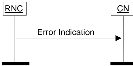
Figure 2. Error Indication, RNC originated.