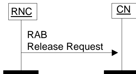
Figure 4. RAB Release Request procedure.

This message indicates the list of RABs requested to be released and cause value for each release request. On receipt of a RAB RELEASE REQUEST the CN shall initiate RAB Assignment procedure requesting indicated RABs to be released.