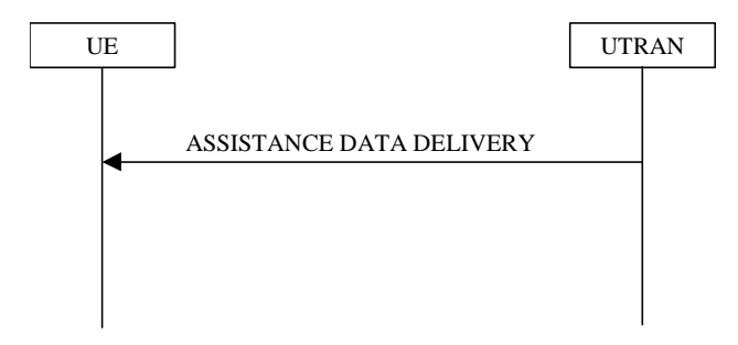
Figure 59 Assistance Data Delivery