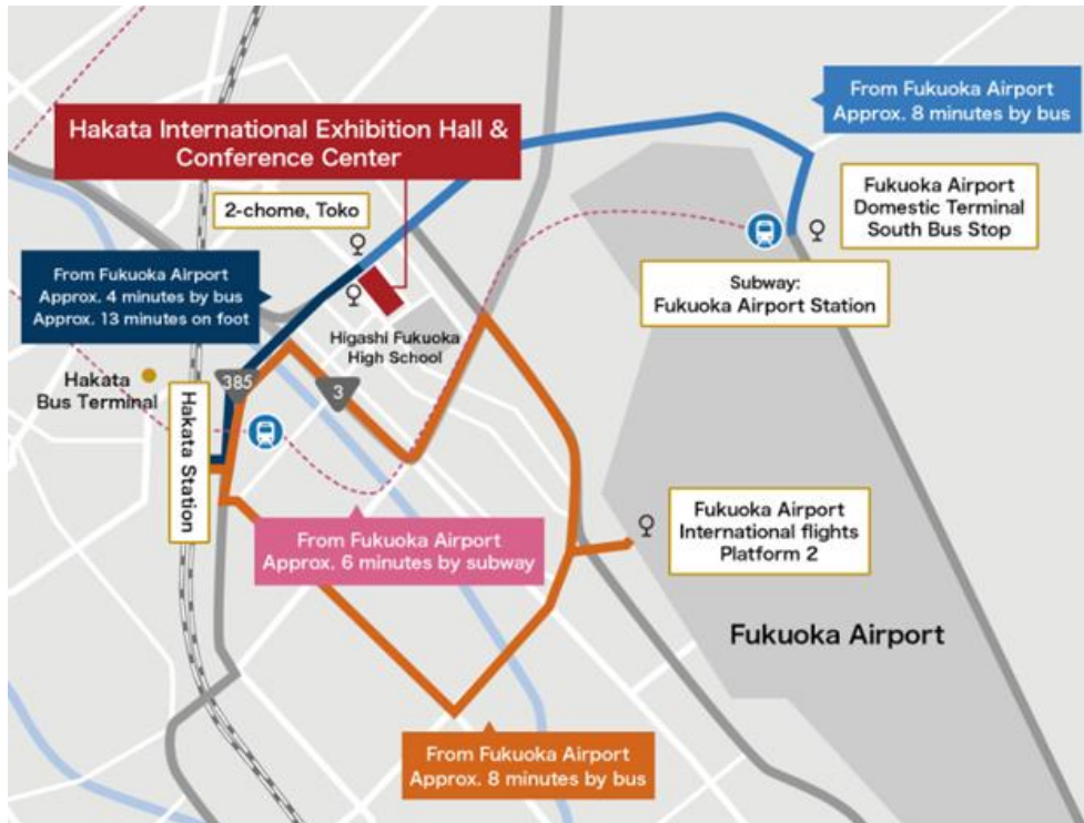
From Fukuoka Airport to the venue