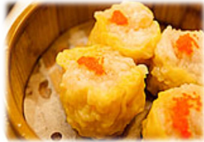
Hong Kong Dim Sum