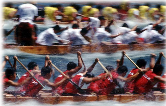
Dragon Boat Race