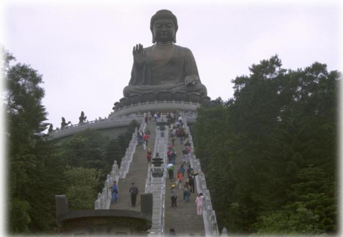
Lan Tau Island