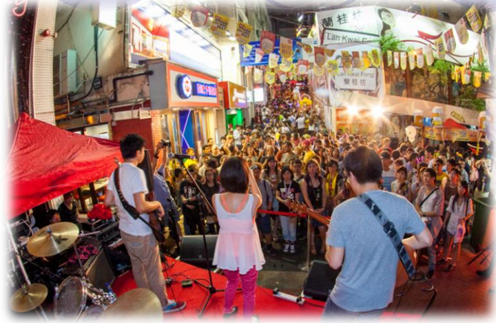
Lan Kwai Fong