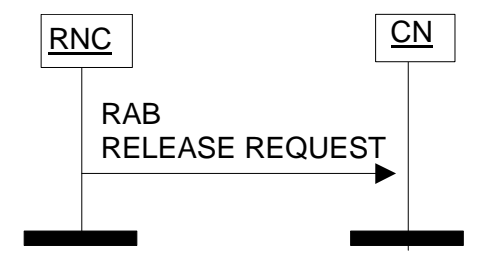
Figure: RAB Release Request procedure