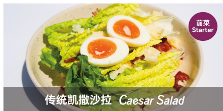
罗马生菜 | 面包丁 | 脆培根 | 溏心蛋 Romaine Lettuce | Baked Garlic Bread | Crispy Bacon | Soft-Boiled Egg CNY 68