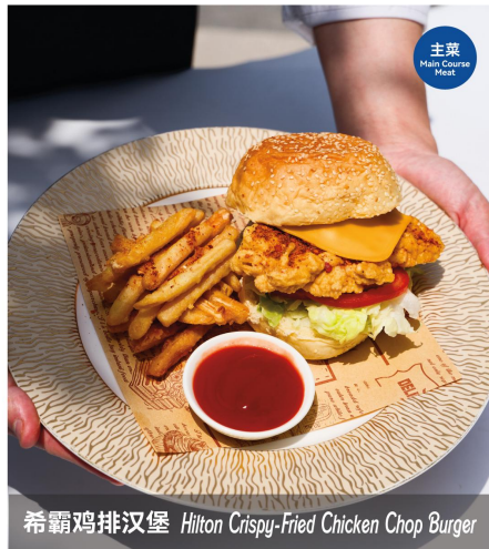
罗马生菜 | 面包丁 | 脆培根 | 溏心蛋 Romaine Lettuce | Baked Garlic Bread | Crispy Bacon | Soft-Boiled Egg CNY 98