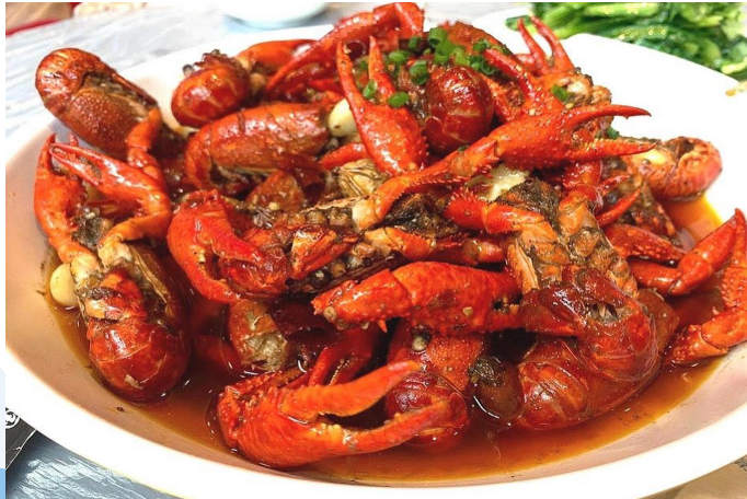
Braised prawns (油焖大虾)