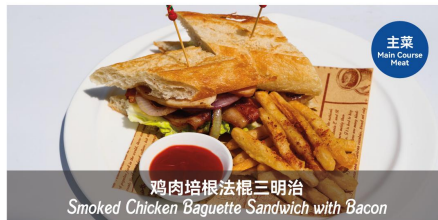
烟熏鸡胸 | 黑醋扒时蔬 | 软培根 | 脆生菜 Smoked Chicken Breast | Grilled Vegetables with Black Vinegar | Soft Bacon | Fresh Lettuce CNY 88