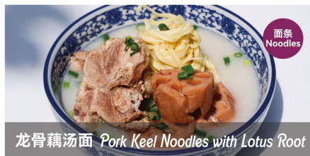
猪龙骨 | 粉藕 | 葱花 Pork Keel | Soft Lotus Root | Spring Onion CNY 68