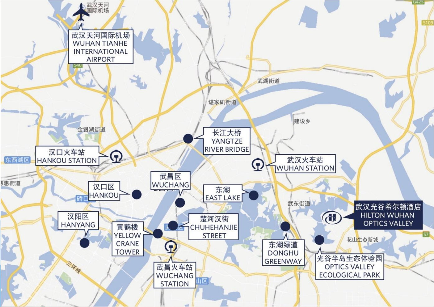
Hilton Wuhan Optics Valley