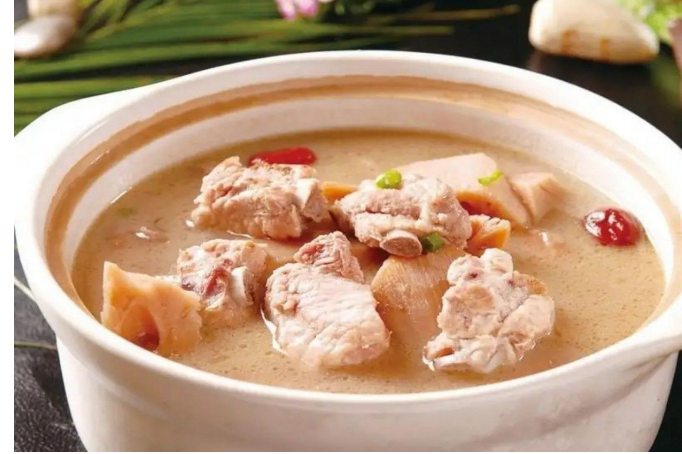
Spareribs and lotus root soup (排骨藕汤)