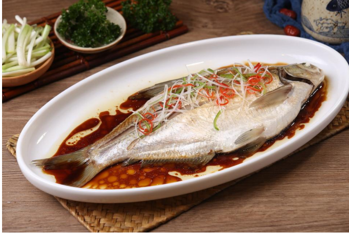
Steamed Wuchang fish (清蒸武昌鱼)