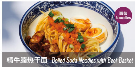
软烂牛腩 | 牛骨汤 | 卤蛋 | 菜心 Soft Beef Basket | Spicy Beef Soup | Marinated Egg | Choy Sum CNY 68