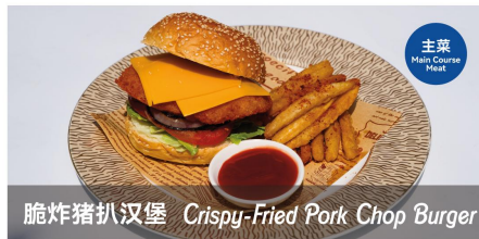
炸猪排 | 番茄 | 脆生菜 | 芝士 Crispy-Fried Pork Chop | Tomato | Fresh Lettuce | Cheese CNY 98