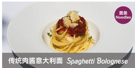
传统肉酱 | 自制番茄汁 | 现创帕马臣 Western Meat Sauce | Homemade Tomato Sauce | Parmesan Cheese CNY 68