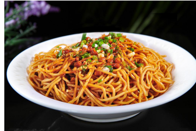
Hot and dry noodles (热干面)