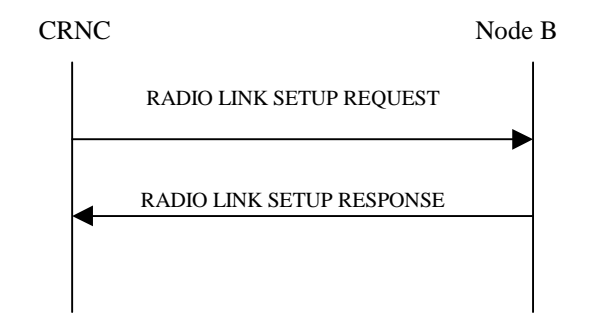
Figure 24: Radio Link Setup procedure, Successful Operation

The procedure is initiated with a RADIO LINK SETUP REQUEST message sent from the CRNC to the Node B using the Node B Control Port.