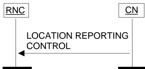
Figure 1: Location Reporting Control procedure. Successful operation.

The CN shall initiate the procedure by generating a LOCATION REPORTING CONTROL message.