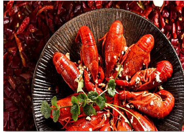
taste shrimp (口味虾)