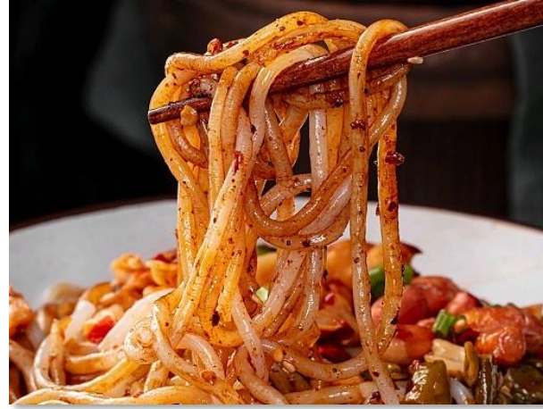
Wordy powder (嗦粉)