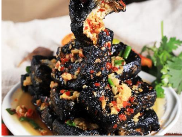
Stinky tofu (臭豆腐)