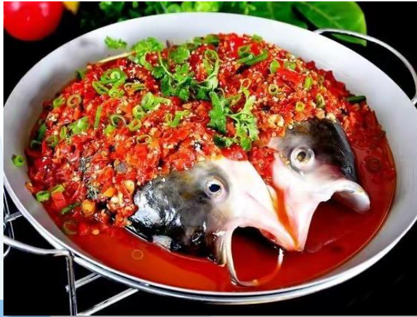
Chop bell pepper fish head (剁椒鱼头)