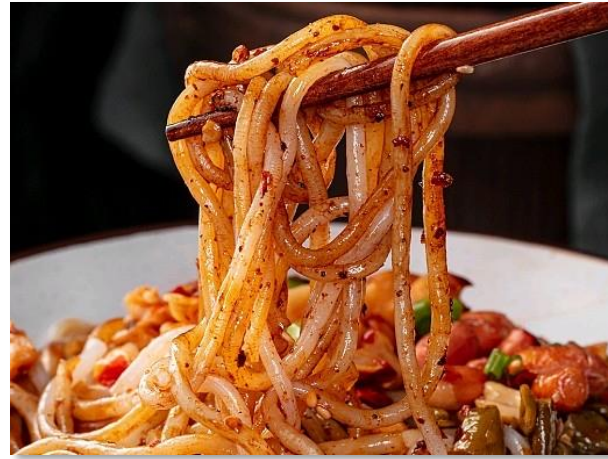
Wordy powder (嗦粉)