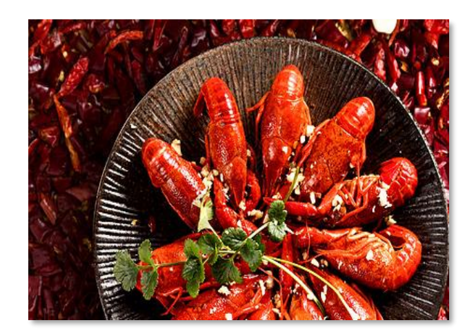
taste shrimp (口味虾)