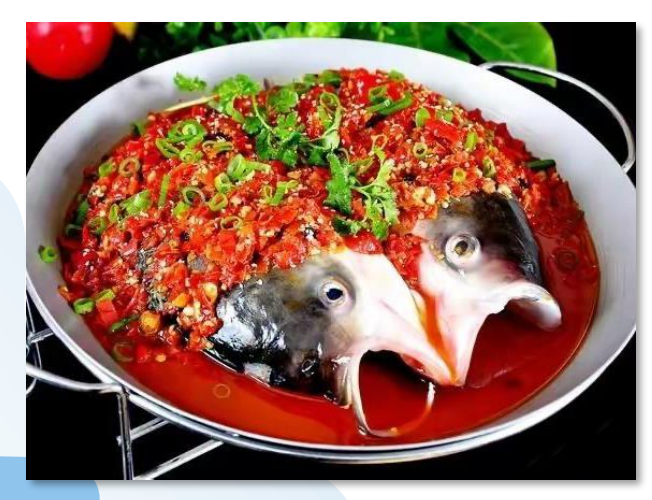
Chop bell pepper fish head (剁椒鱼头)