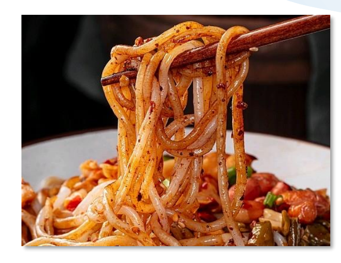
Wordy powder (嗦粉)