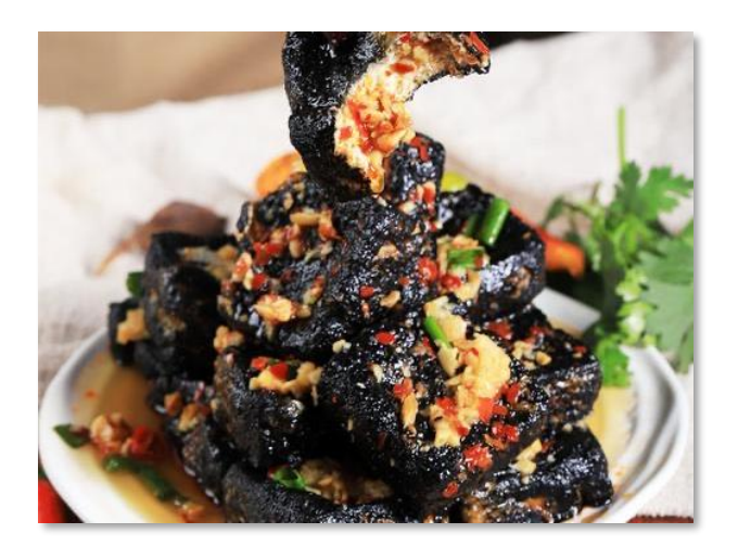
Stinky tofu (臭豆腐)