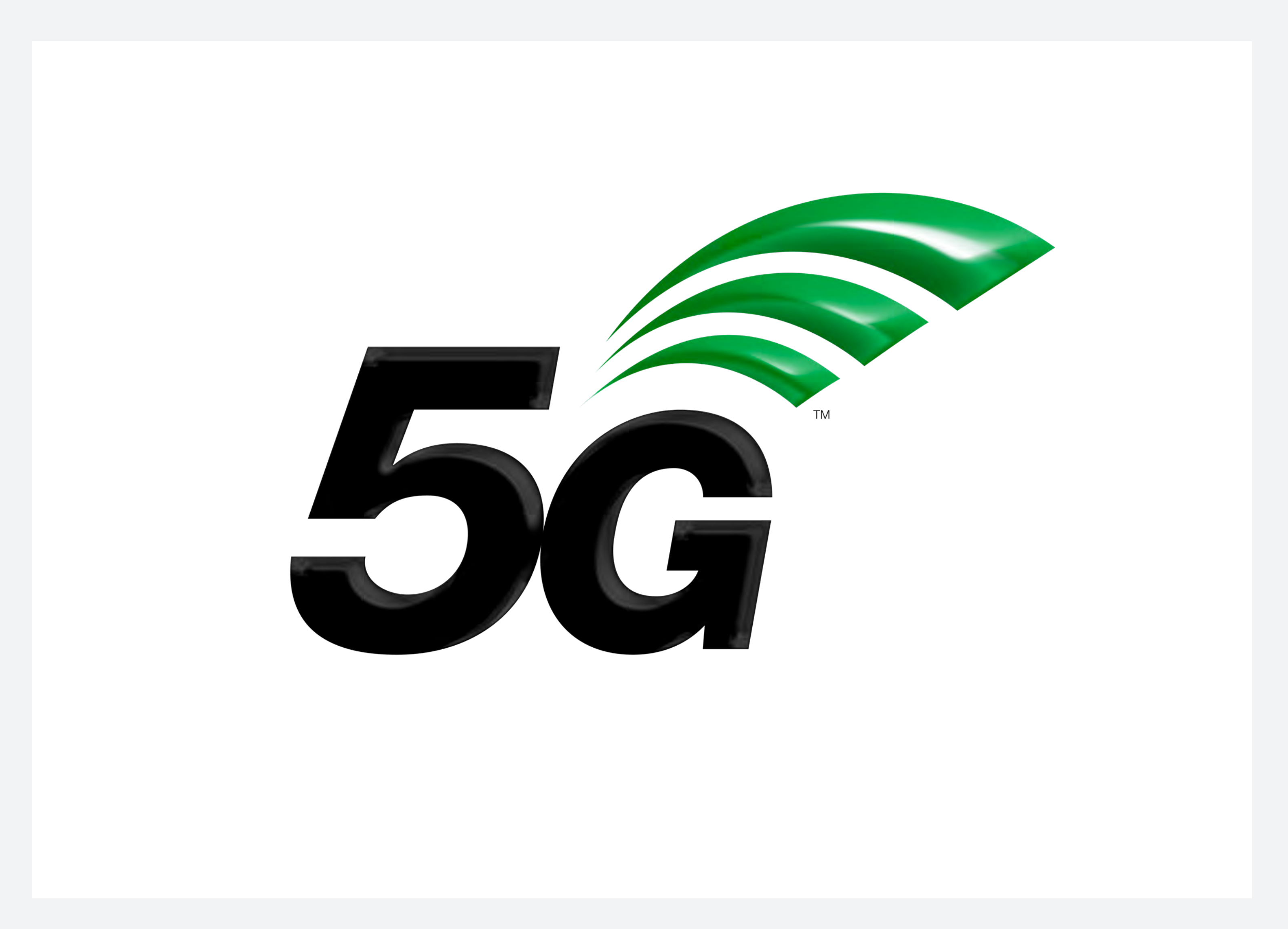
Approved 5G Logo

After submitting the request, the applicant will either receive an acknowledgement and the terms of use that need to be complied with or a rejection. Further, with regards to the logo the successful applicant will receive a copy of the 3GPP 5G logo for use.