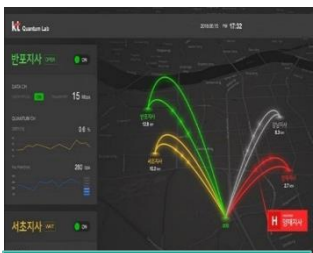
3GPP support for QKD