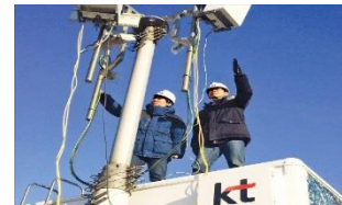
Full Duplex Radio