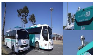
Full Autonomous Driving

Here are some candidate features for standardization in Release-17