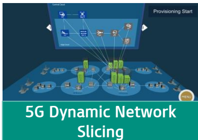
5G Dynamic Network Slicing