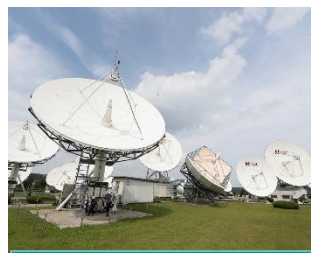
5G Satellite Support