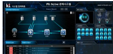
3GPP Support for A.I. based Intelligent NW