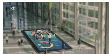
Private NR Network